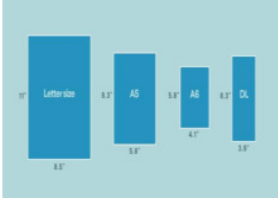
A5 on Gloss paper material